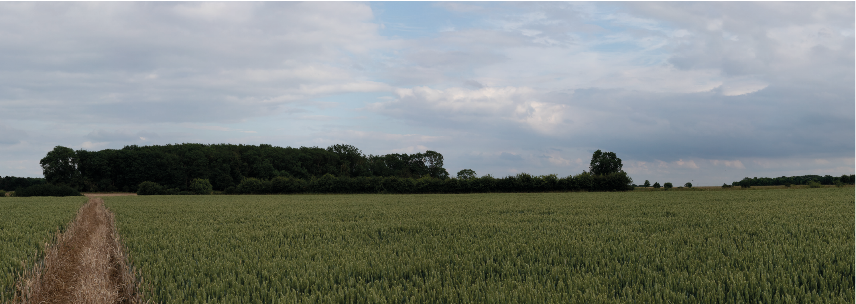
Illustrative Viewpoint B (Right-centre) - Public Footpath Carl/4/1 between Carlby and Braceborough Great Wood