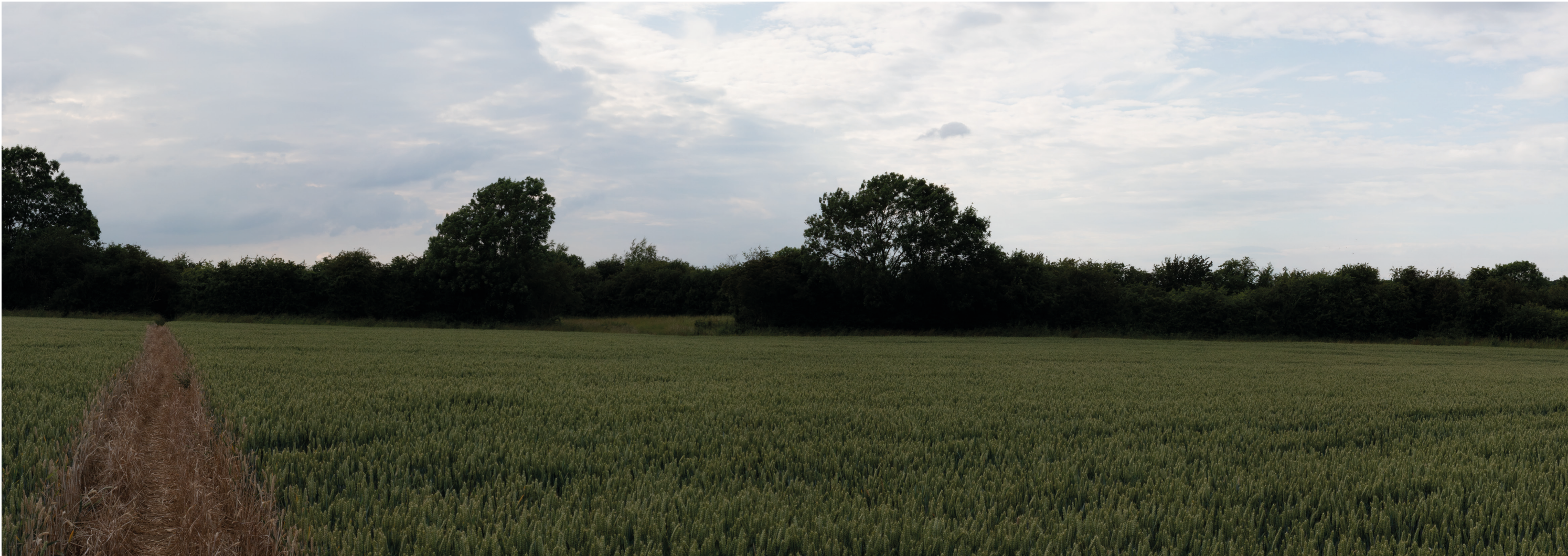
Illustrative Viewpoint B (Right) - Public Footpath Carl/4/1 between Carlby and Braceborough Great Wood