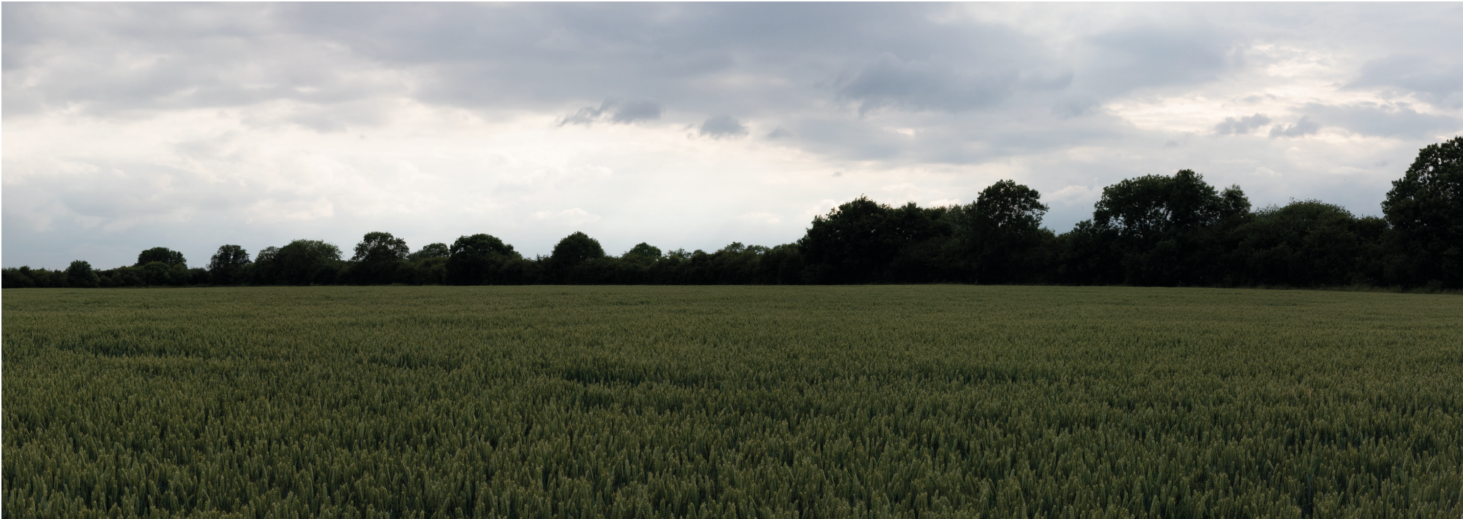
Illustrative Viewpoint B (Right-centre) - Public Footpath Carl/4/1 between Carlby and Braceborough Great Wood